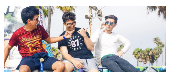
HOMESTAY (SHARED ROOM), BREAKFAST AND DINNER: INCLUDED. (UPGRADE TO A PRIVATE ROOM IS SUBJECT TO AVAILABILITY). TICKETS AND TRANSPORTATION TO THE ACTIVITIES: INCLUDED. (UPGRADE TO A PRIVATE ROOM IS SUBJECT TO AVAILABILITY).