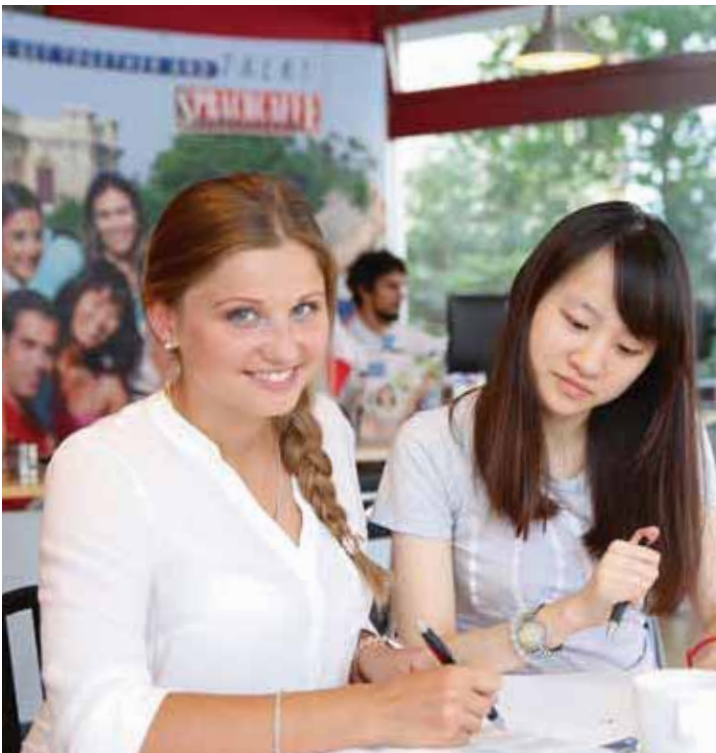
Our school in Frankfurt is located at our global headquarters in Sachsenhausen, the most vibrant area of the city. Students have endless leisure opportunities, such as bars and restaurants, right on their doorstep.

The city on the banks of the Main is not only known for its banking district but also for its multitude of ethnic groups.