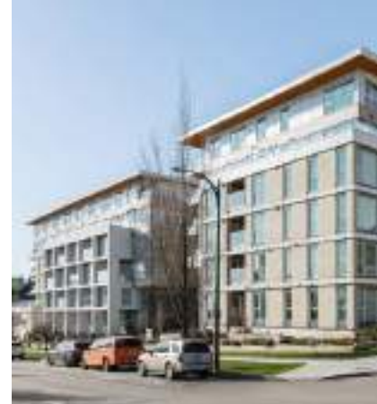
▲ GEC - Student Residences - Vancouver and Burnaby, BC

Transfer prices can include up to 2 people per vehicle - same flight & address