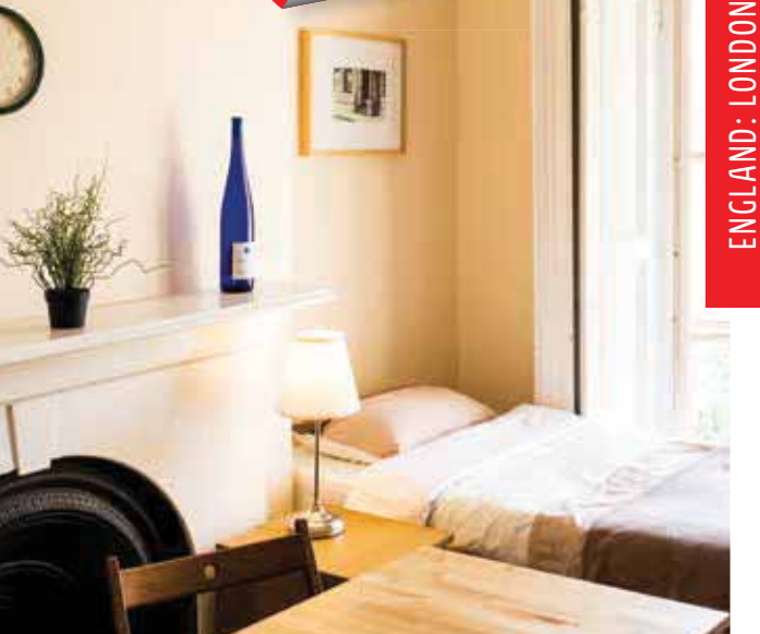
Situated in the West London district of Ealing, our homestay hosts are easy to reach and provide a very pleasant place to stay.