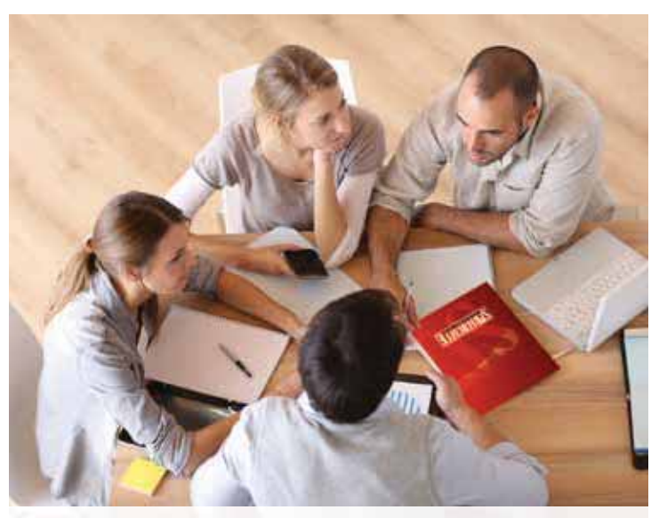
The school features well equipped classrooms, a common room and a patio garden. Students need to be aged 18 to participate in adult programmes.