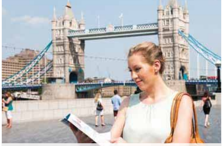
All of the exciting landmarks and activities of the most famous metropolis are right at your fingertips.